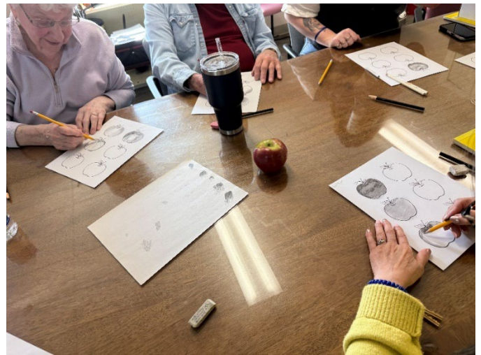
Here are some Art Club members practicing a few shading techniques.