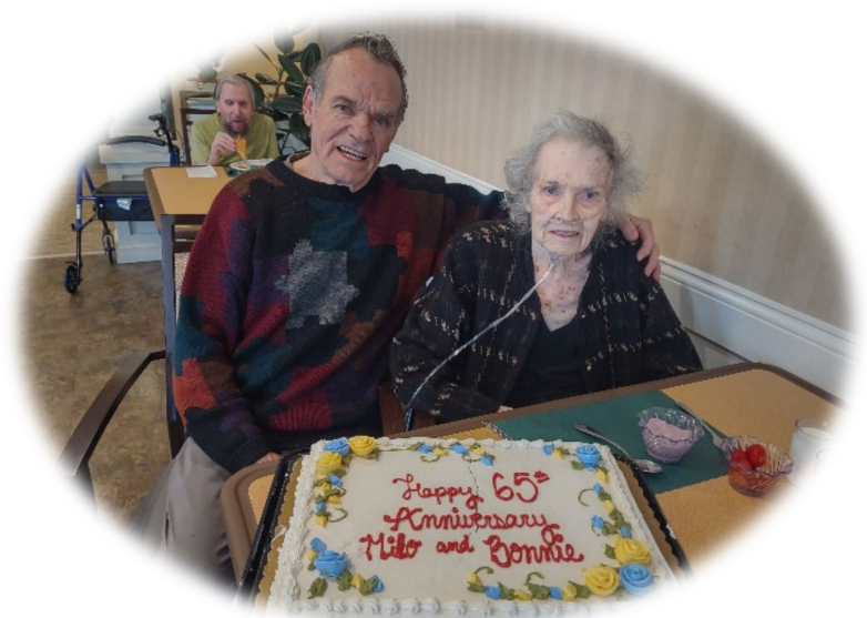
Cake provided by Longview Dining Staff!